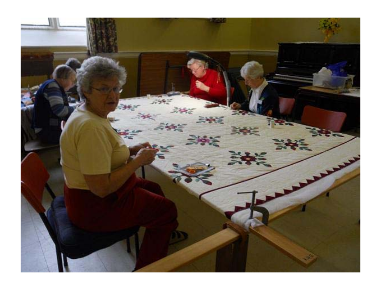
Quilting on the December Rose.