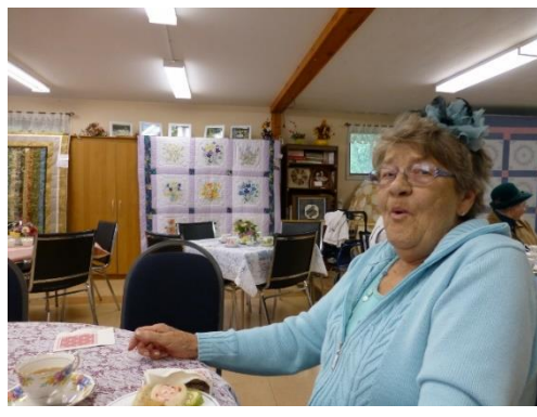
November 2014 4