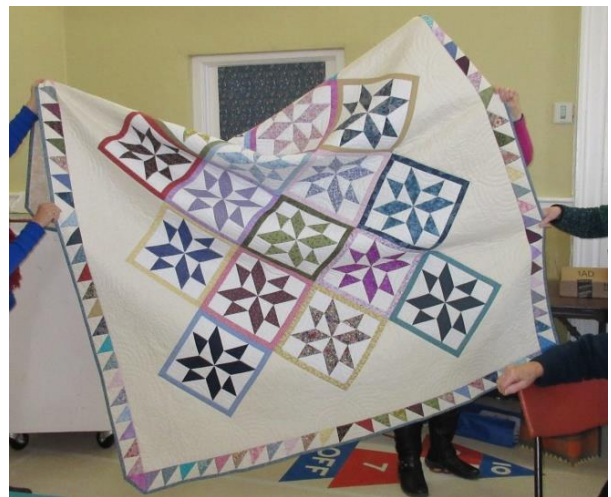
Gail's raffle block quilt is all done and ready for the show!