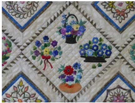
Sally's incredible "Baskets, Blooms and Berries"