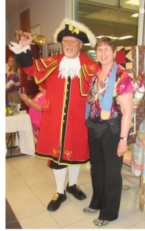
Enjoying the show with old quilting friends and family.