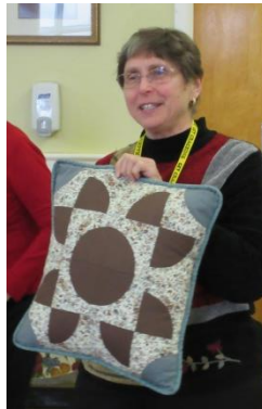
A few of the results from the paper bag challenge