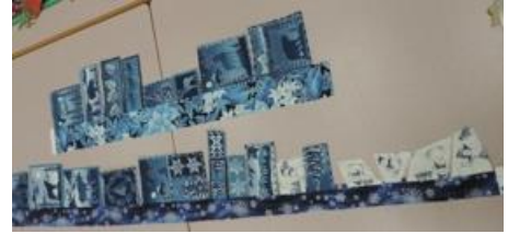
View from our condo.

I've been attending most of the weekly meetings of the Valley Piecemakers Quilt Guild since arriving in this area. They meet in the sewing room of the local high school on Thursday evenings, and work on a variety of projects often demonstrated by the members. They often make community quilts and the latest ones were based on a kind of crazy quilt idea. It begins with a dark triangle in each block, all the same, then strips are added at random on a plain cotton foundation. Often leftover scraps are used and it's great for using up fabric no longer needed or wanted. And the foundation can be a used cotton or flannel sheet (from the Thrift store?)