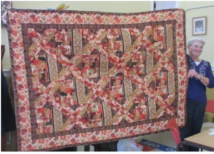
Another beauty from Bernice