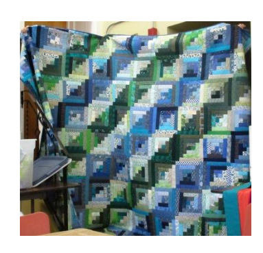
Another Phyllis' log cabin beauty

One of Eileen's miniature butterfly hangings