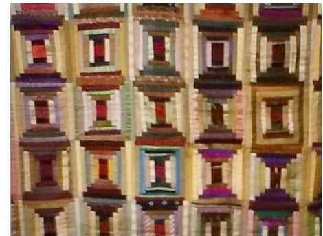
Court House Steps c. 1870-75