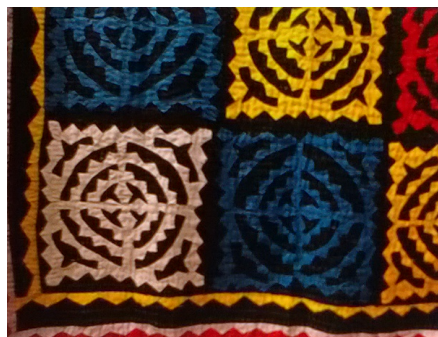
Ralli Quilt from Hyderabad, Pakistan c. 2014

There was a large range of quilts selected for the display including a barn quilt outside.