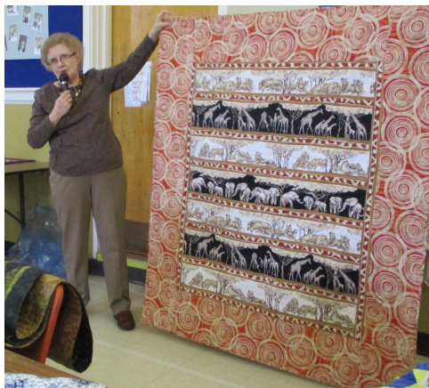
Diane D: the fabric was too good to just be put on the back.