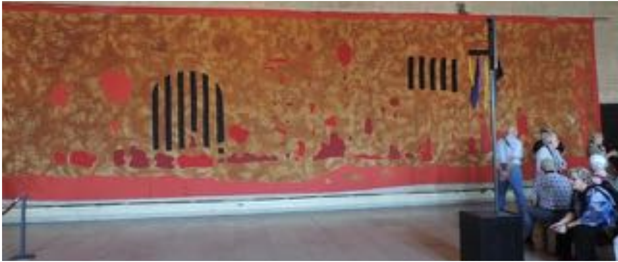
This one is named 'La Zone de Grands Lac' and measures 800 x 300 cm.