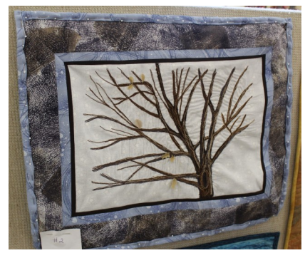
The entries for the Wiggles and Waves Challenge