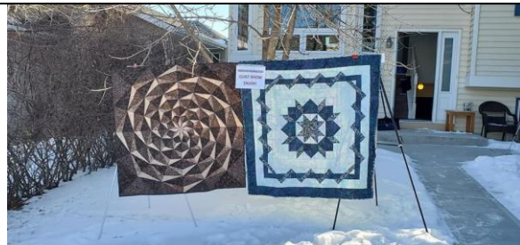
Did a #neighbourhoodquiltshow today. It was fun to see people out for a walk, stop and look at the quilts. Think I may do this every day with 1 quilt per day. Maybe a good way to organize, photo and record each of my many quilts!