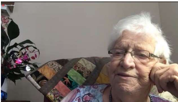
KHQ send best wishes at zoom party!