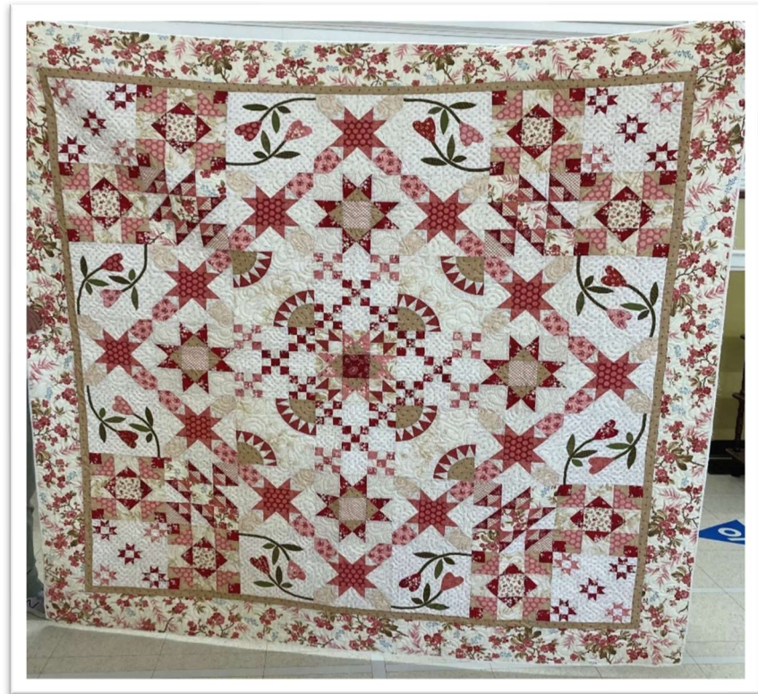
Two quilts shown by Lyn.