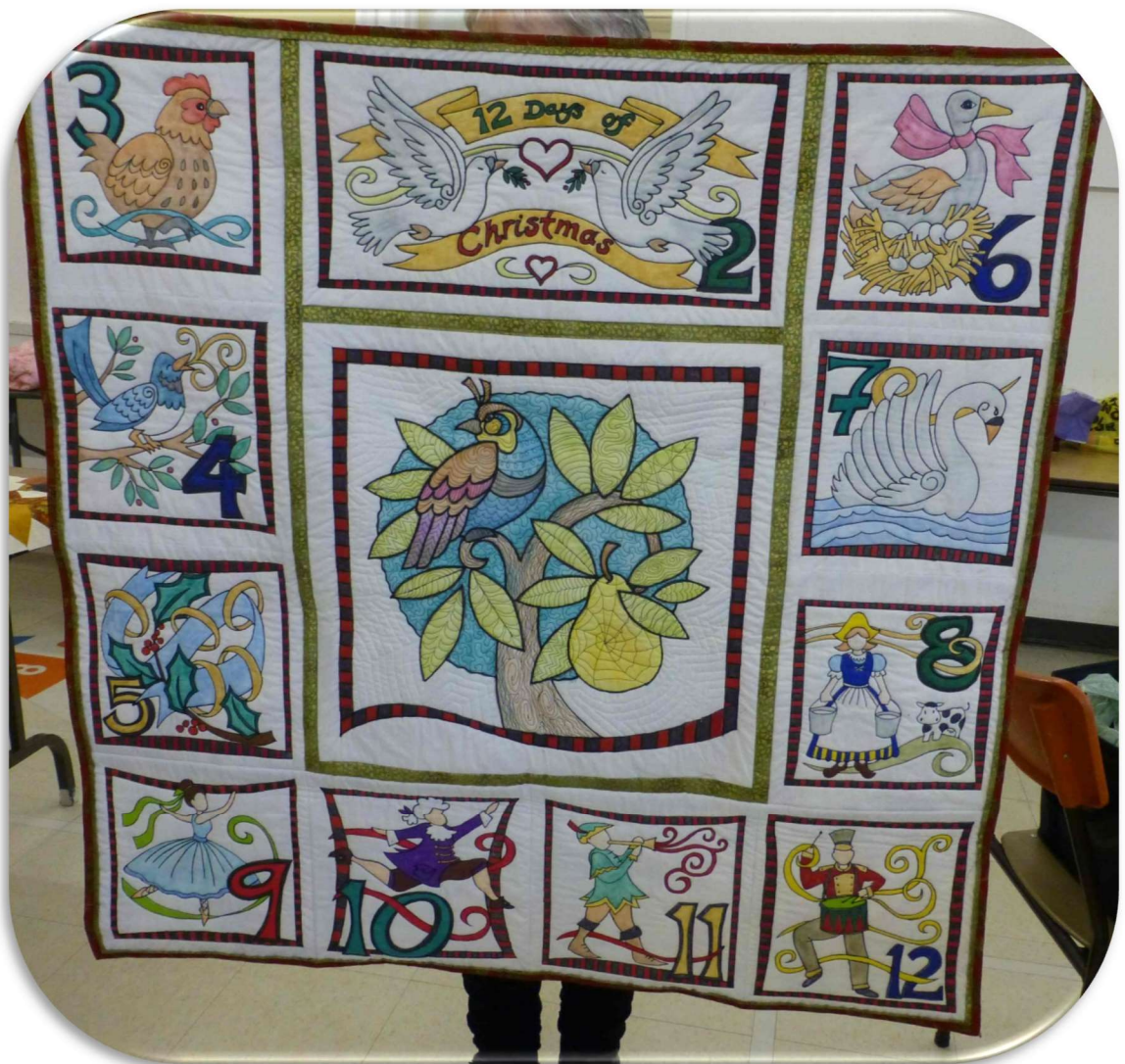
and the Twelve Days of Christmas Quilt.