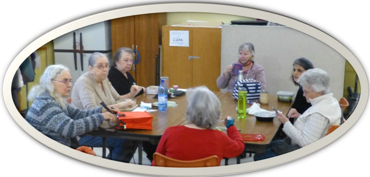
Working on the Canada quilt.