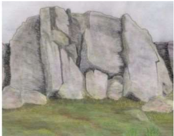
Icelandic Outcrop Phillida Hargreaves